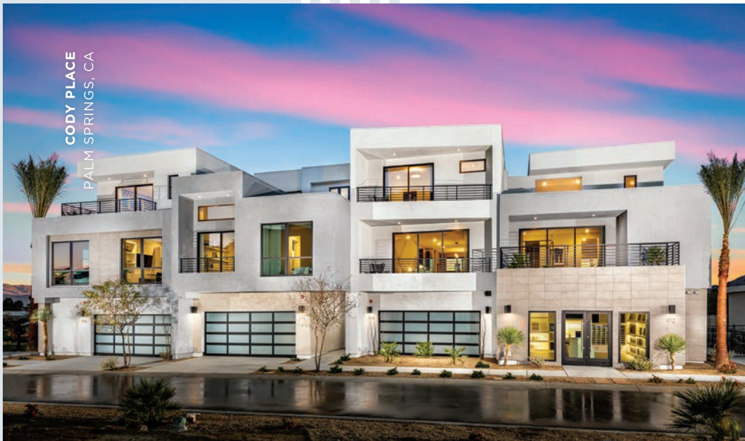
CODY PLACE PALM SPRINGS, CA