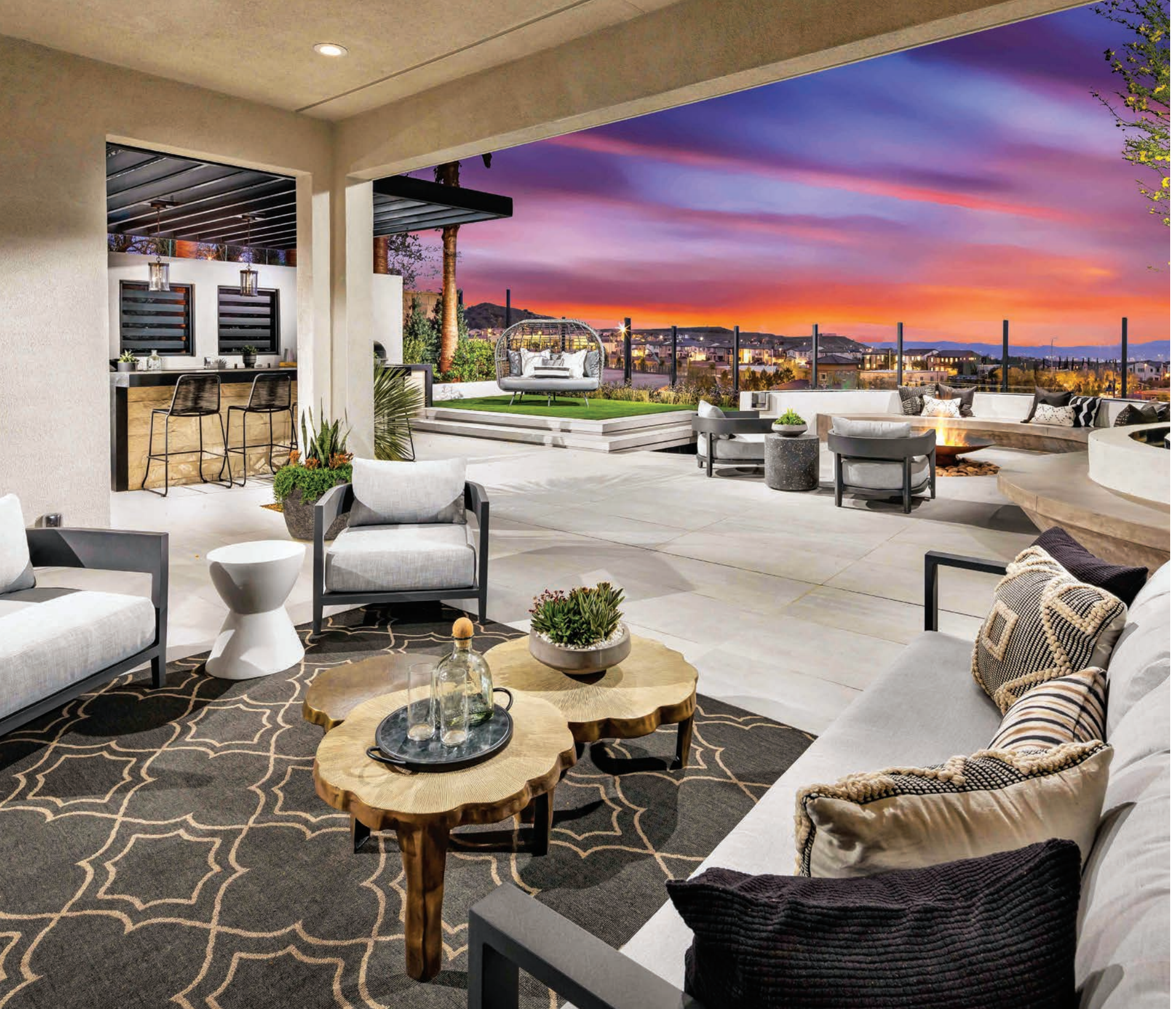
POWELL HILLCREST AT PORTER RANCH | PORTER RANCH, CA