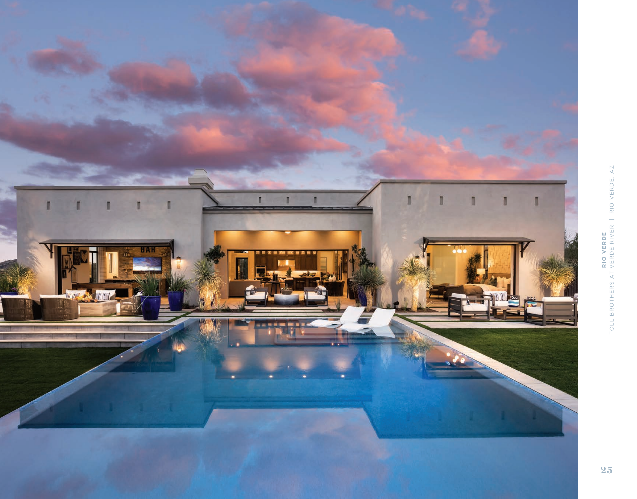
RIO VERDE TOLL BROTHERS AT VERDE RIVER | RIO VERDE, AZ