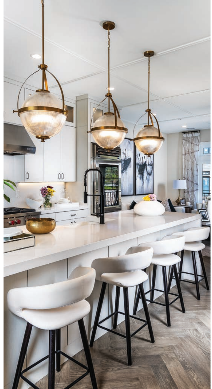
CARROLL EDGE-ON-HUDSON | SLEEPY HOLLOW, NY