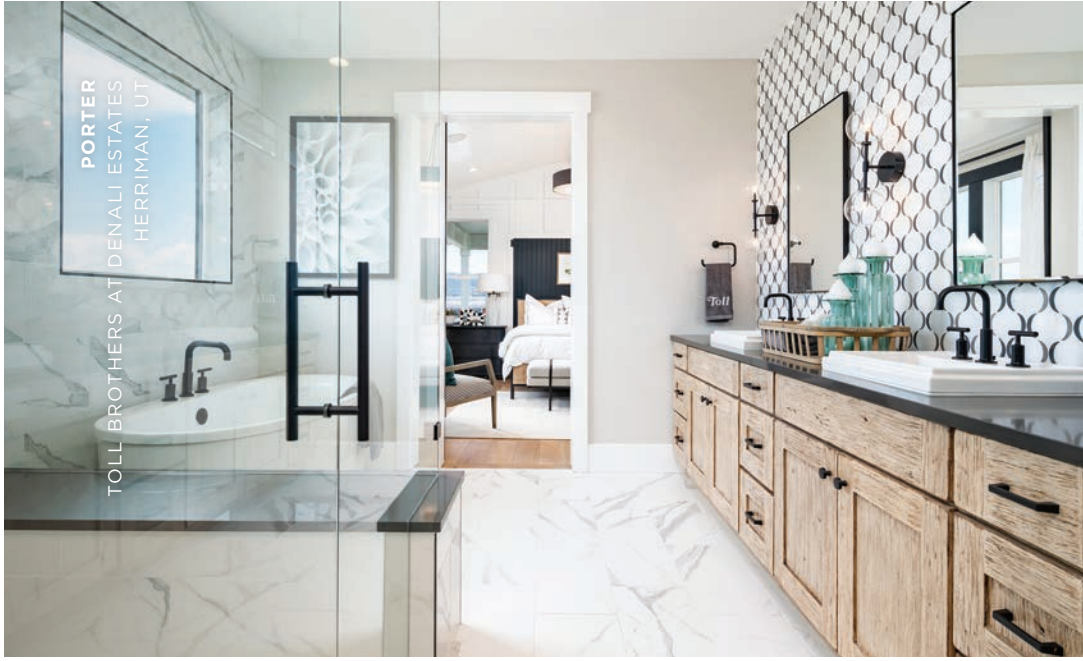
PORTER TOLL BROTHERS AT DENALI ESTATES HERRIMAN, UT