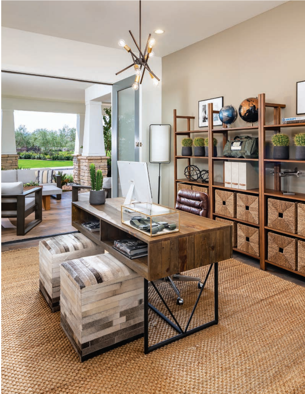
CLOVERDALE STERLING GROVE | SURPRISE, AZ