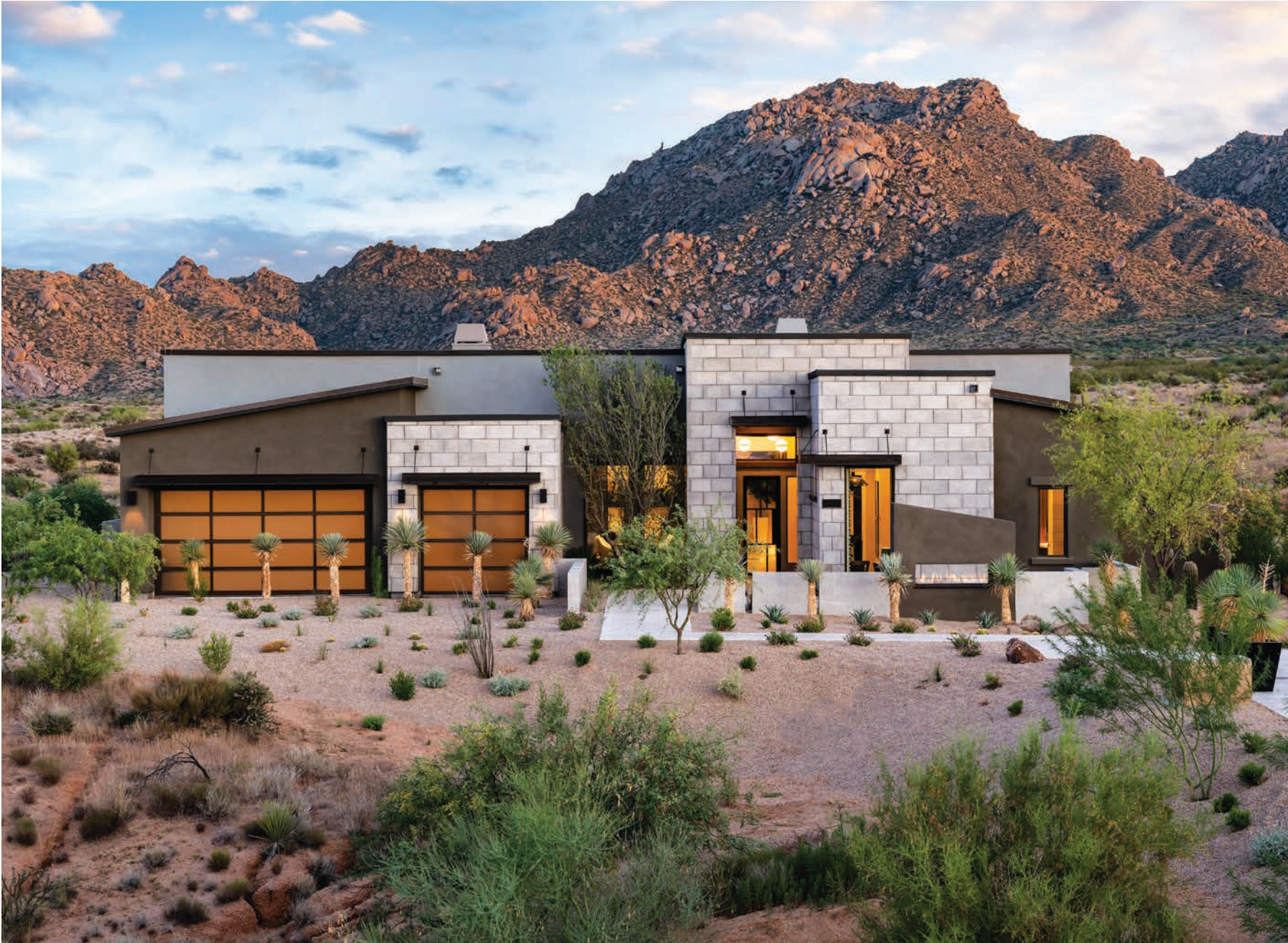
MAYNE SERENO CANYON | SCOTTSDALE, AZ