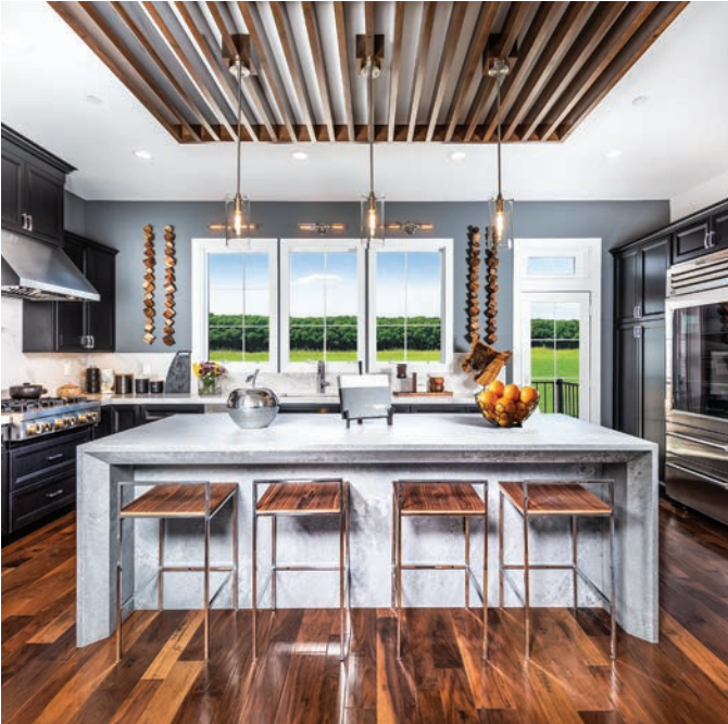
PARK EDGE-ON-HUDSON | SLEEPY HOLLOW, NY