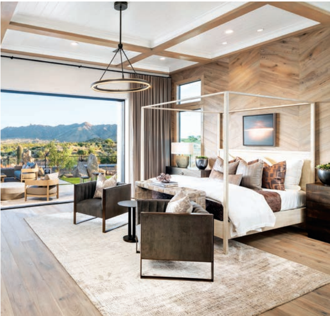
MUNARI BOULDER RANCH | SCOTTSDALE, AZ