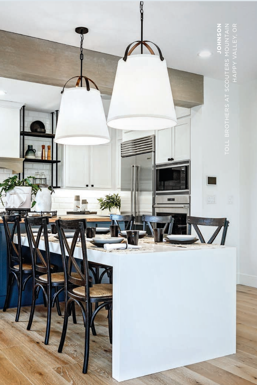
JOHNSON TOLL BROTHERS AT SCOUTERS MOUNTAIN HAPPY VALLEY, OR