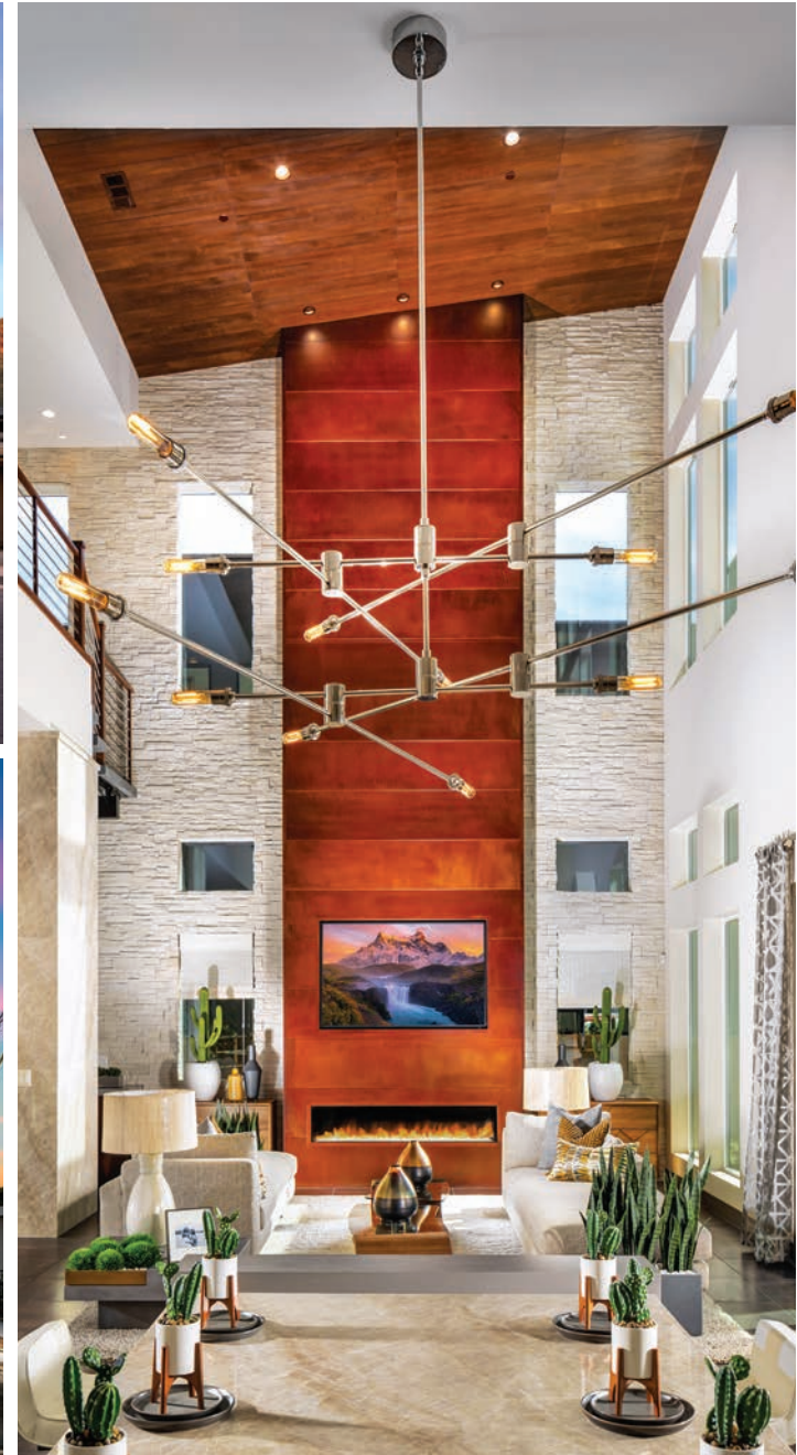
KEYSTONE MESA RIDGE | LAS VEGAS, NV