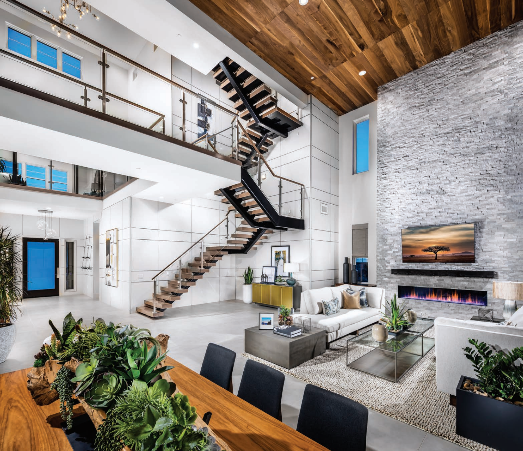
SANTI ELITE WESTCLIFFE AT PORTER RANCH | PORTER RANCH, CA