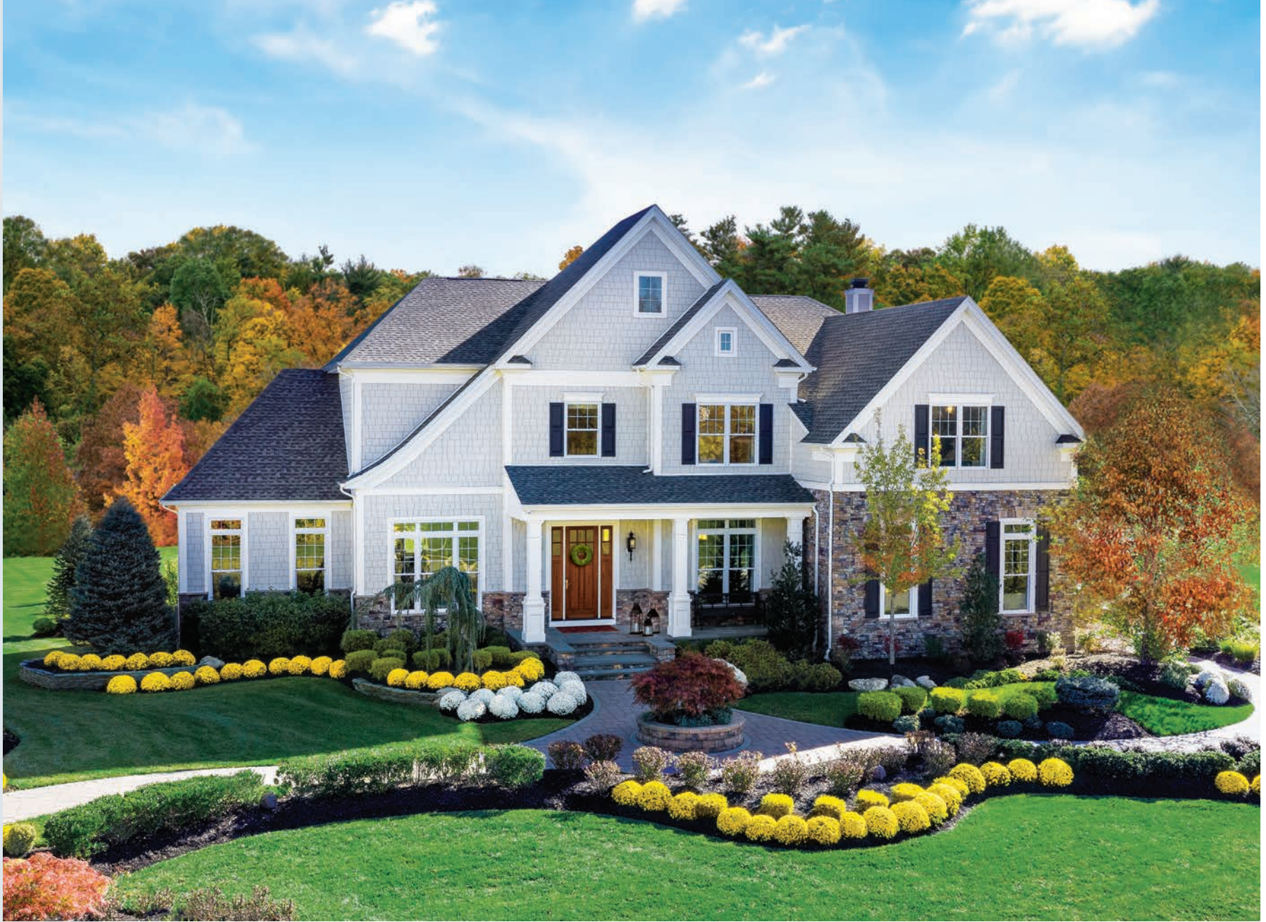
HUDSON ESTATES AT BAMB HOLLOW | LINCROFT, NJ