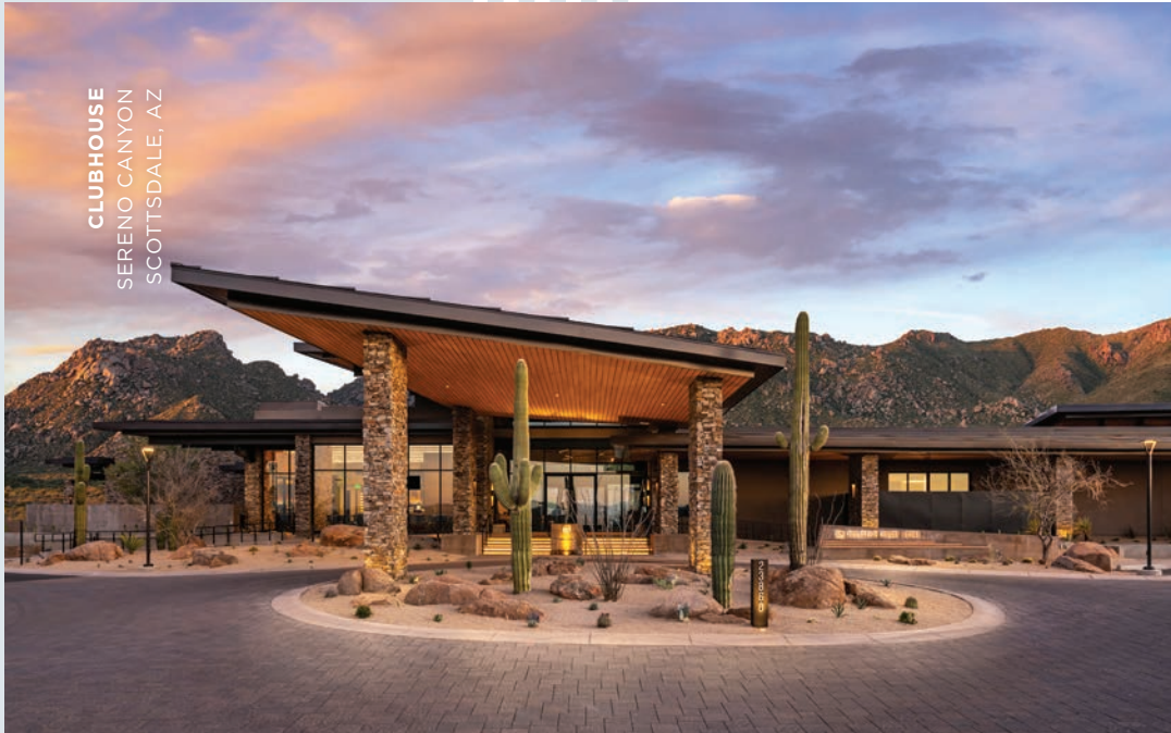
CLUBHOUSE SERENO CANYON SCOTTSDALE, AZ