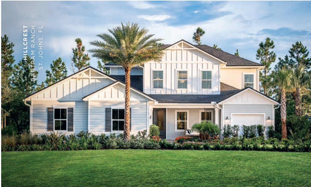
HILLCREST BARTRAM RANCH ST. JOHNS, FL